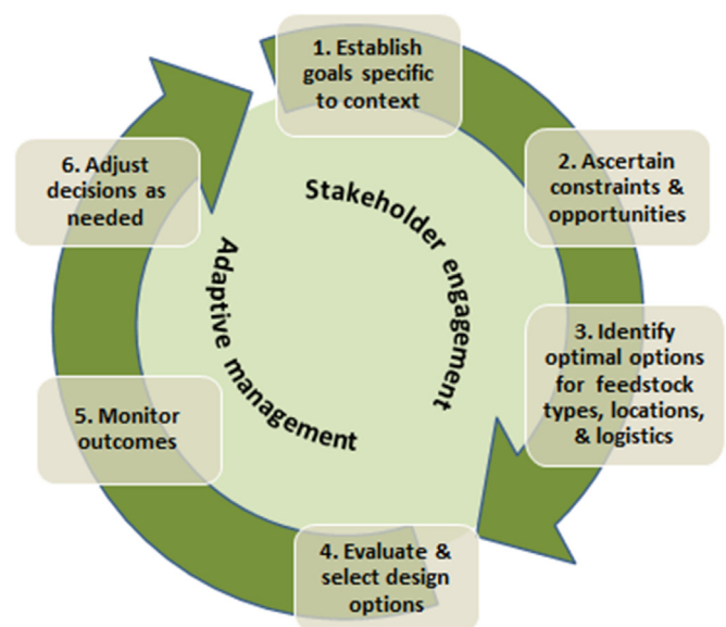
Fig. 1. Steps in landscape design.

One recommendation is that a landscape design approach for bioenergy be applied via six steps: (1) develop design goals in